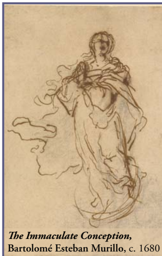
The Immaculate Conception, Bartolomé Esteban Murillo, c. 1680