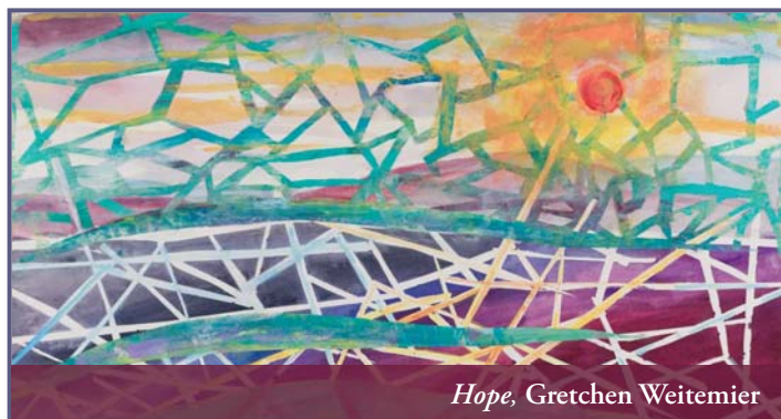
Hope, Gretchen Weitemier